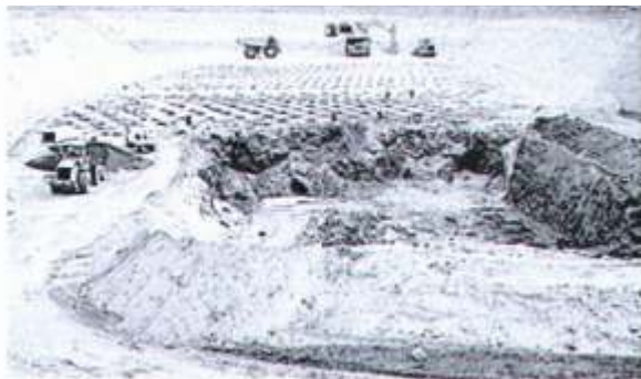
Cairn Hill – Pit1, first blast, shot being loaded, with drilled ground and partial mining fleet in background

SBR, a subsidiary of SCT Logistics, has been contracted to provide rail haulage and maintenance of the rail wagons that IMX is leasing from Gemco (ASX announcement 25 May 2010).